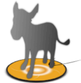
Space Weather DONKI