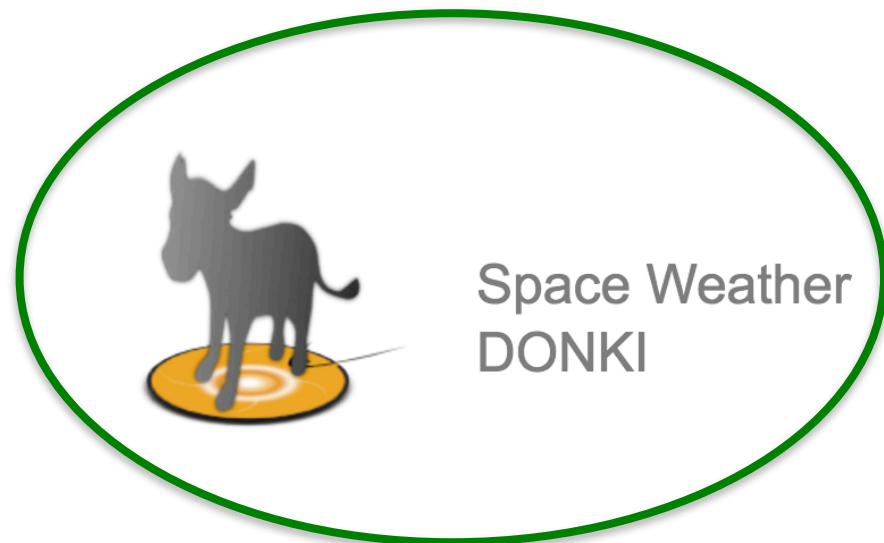
Space Weather DONKI