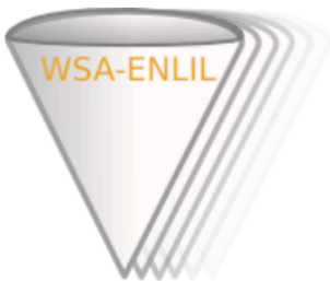
WSA-ENLIL Cone Fast Track